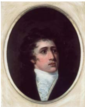
John Eager Howard age 17

Both boys joined the Thomas Johnson Society of the Children of the American Revolution as well.