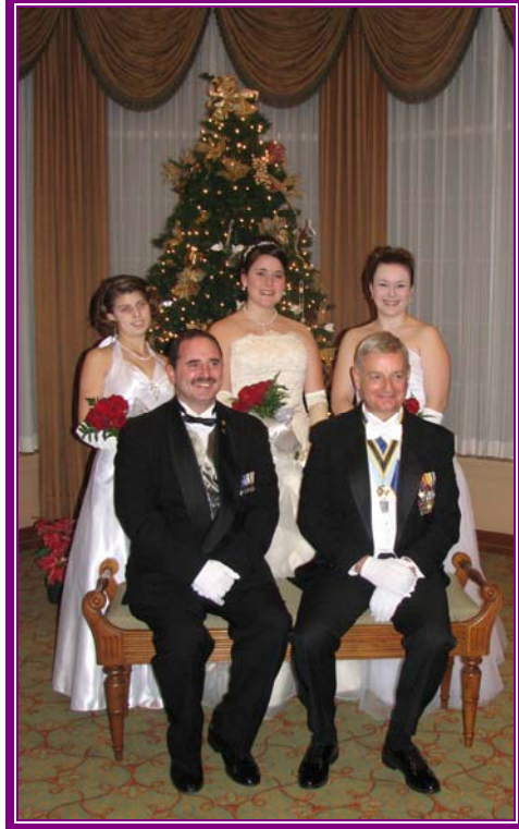
Patriots' Ball at Turf Valley Resort

Pericles (c495 BC-429 BC) Athenian Statesman/Leader during the Golden Age of Greece who fostered the power of democracy which was a very radical idea.